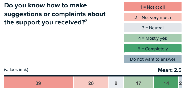
Figure 3: Feedback mechanisms

Do you know how to make suggestions or complaints about the support you received? 7